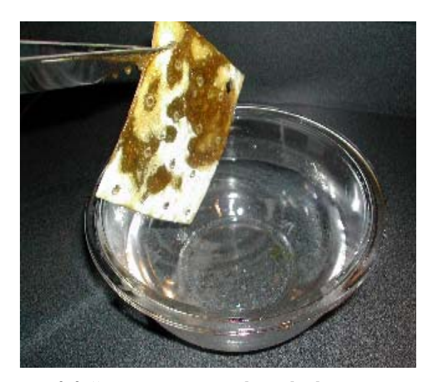
(4) "Presto" the oil spill is gone