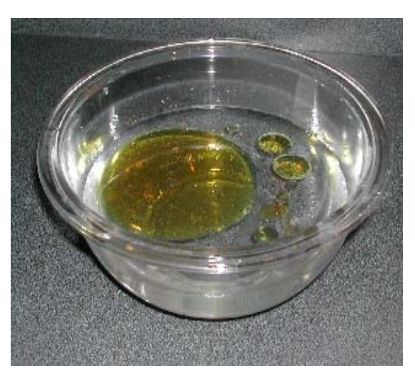
(2) Oil is then applied