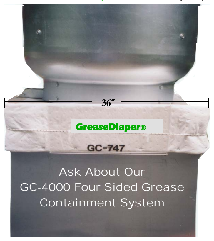
The GC-747 System prevents oils and grease from spilling onto a clean roofs. The GC-747 Four Sided GreaseDiaper® System is the most diversified and cost-effective product available.

The GC-747 GreaseDiapers® System collects Fats, Oil and Grease that spills from roof-top exhaust equipment. The GC-747 GreaseDiapers® System is equipped with four durable replacement GreaseDiapers® that are hydrophobic.