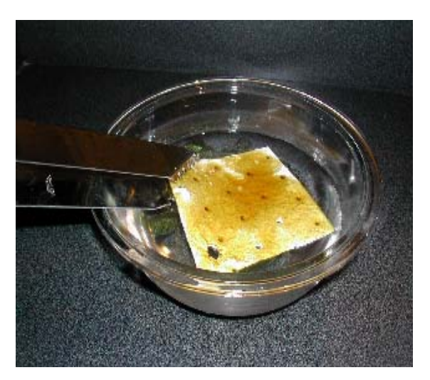
(3) A swatch of our GreaseDiaper®