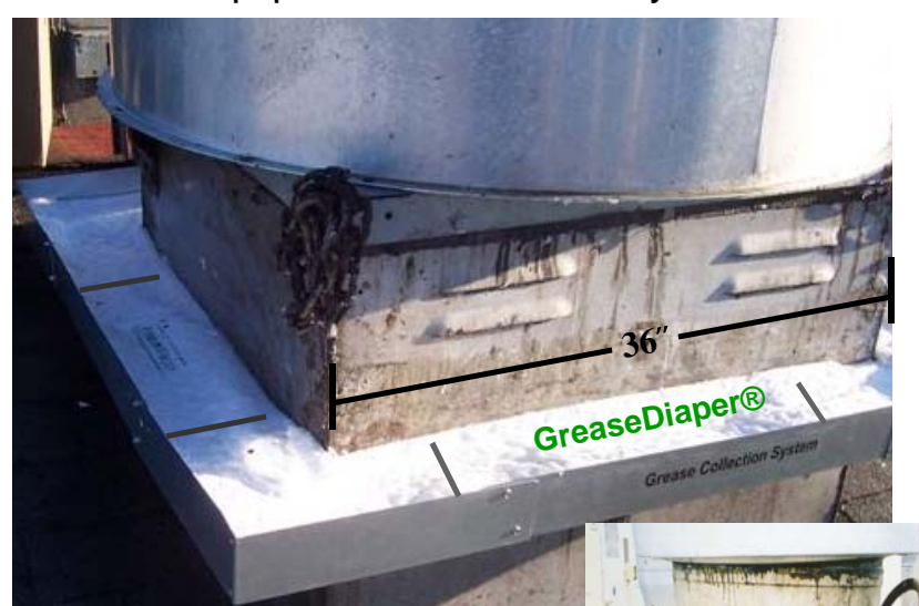
GC-4000 One Size Fits All Fits Up To 36"x 36" Curb Larger Sizes Are Available

The GC-4000 Grease Containment System is a four sided system that collects and traps grease and oils that spill from rooftop fans. The GC-4000 Grease Containment System is equipped with four durable replacement GreaseDiapers® that are hydrophobic. Our Equipment Meets Industry Standards and Roofing Specifications.