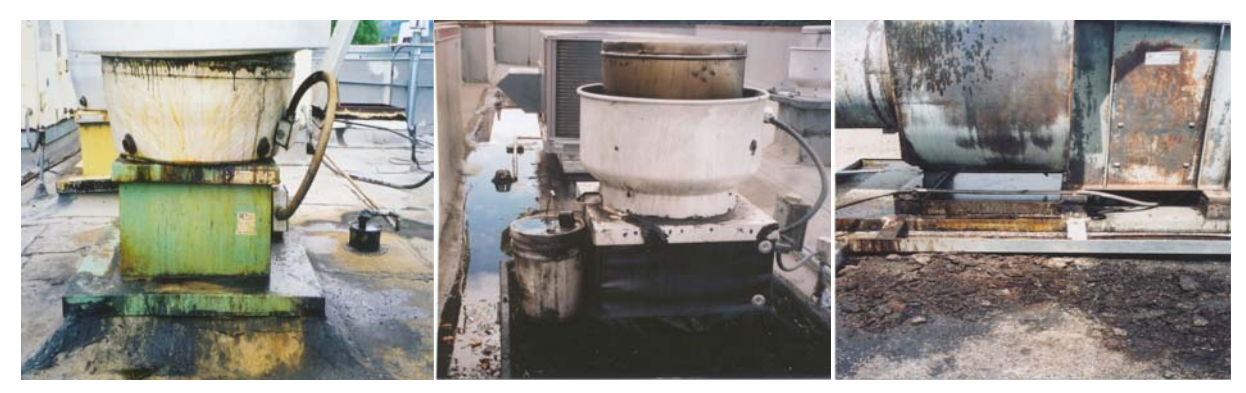
Grease Is Spilling Ever Day Onto Rooftop Across The Country

Rooftop equipment is notorious for causing grease and oil spills. When grease and oil comes in contact with a roofing system it causes premature roof damage. Damage that is caused by grease and oil spills void roof warranties.