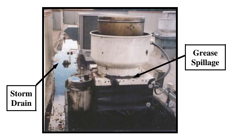
An actual photo of a common rooftop problem. If not corrected this problem can cause premature roof damage.