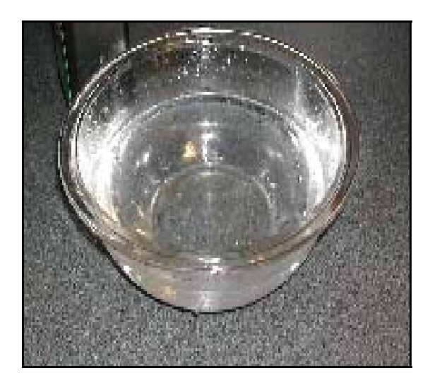
(1) A bowl of clean water

The difference between our products and others is, the GreaseDiaper ® performs as a diaper and not a typical filter. Our GreaseDiaper ® is designed to collect and trap the contaminants and not allow them to pass through onto the roof.